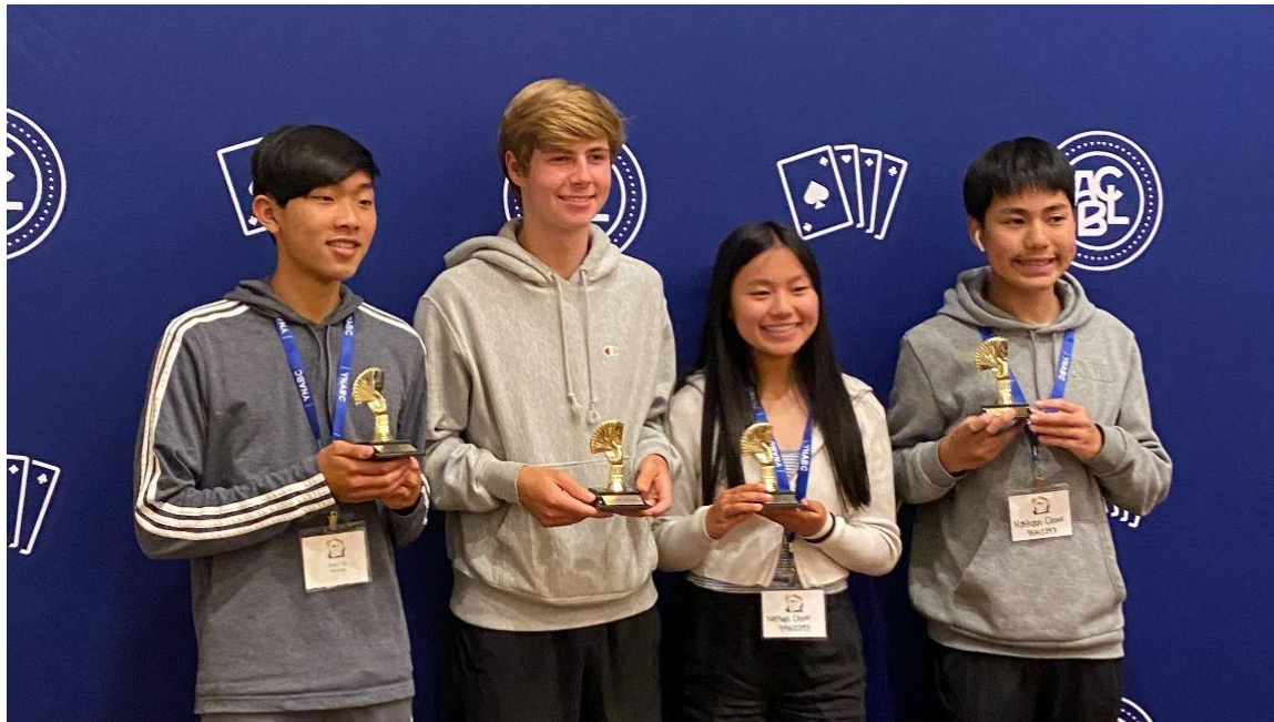
Winners of the Saturday Consolation Swiss Teams: